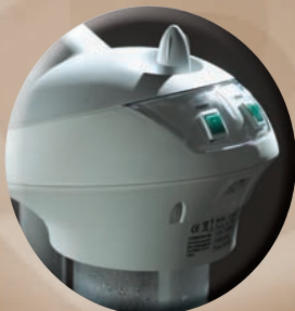
Dynamic Control (Ozone)