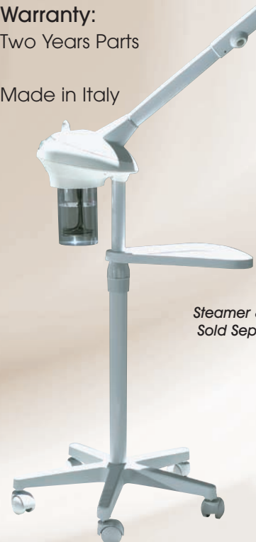
Steamer & Stand Sold Separately